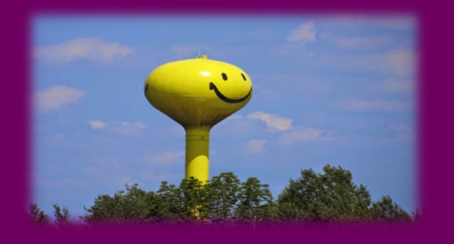
MSU Extension works to teach citizens how to implement best practices in good governance that keeps communities solvent, productive and engaged.