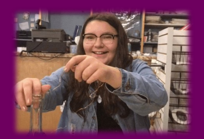
Baraga County 4-H Homemade Christmas SPIN Club.